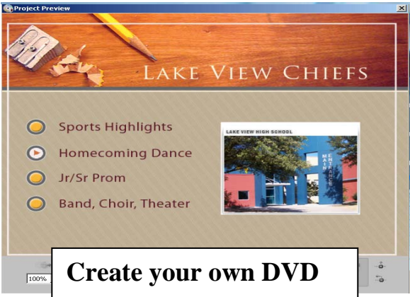
Create your own DVD