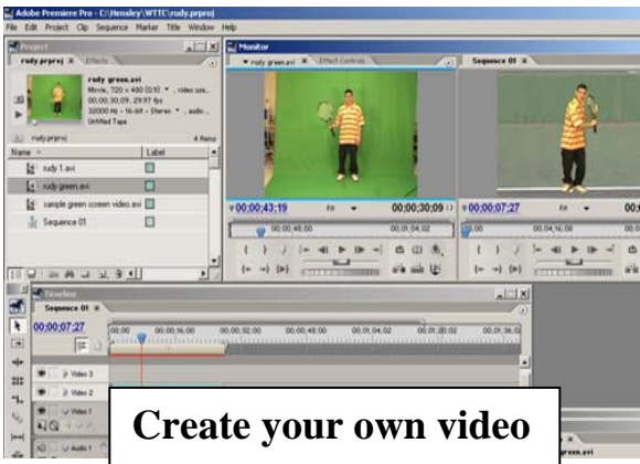
Create your own video